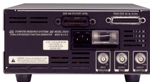
DS340 rear panel (w/ opt. 01)